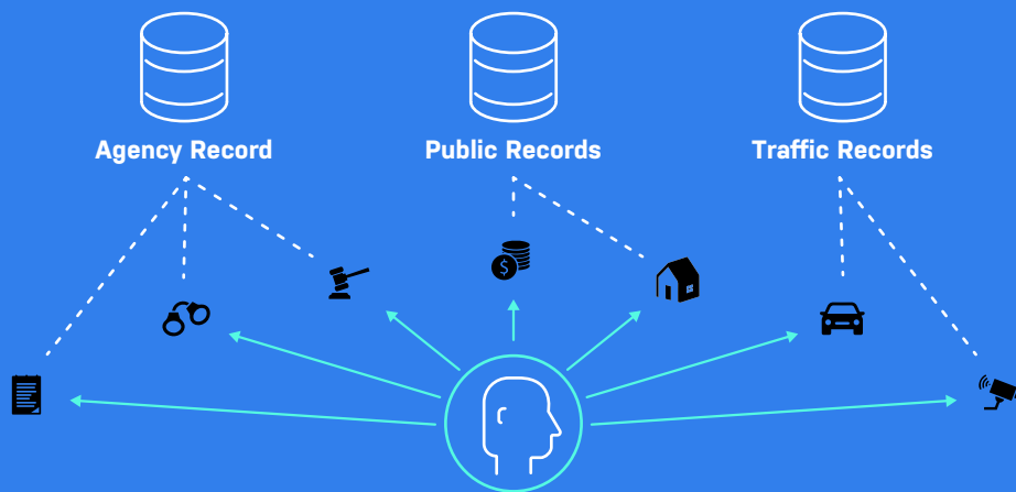
A suspect often appears in several different databases

The idea hinges on who knows who. If Person X has come to attention of the authorities for whatever reason, who else in Person X's network might be of interest? This complexity is hard to capture and explore through conventional database technologies like RDBMS. Graph database platforms excel at analyzing connected data.