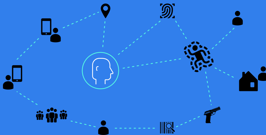
Bystander investigated due to deep connection found